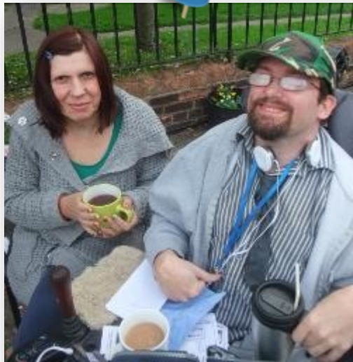
Old friends catching up!