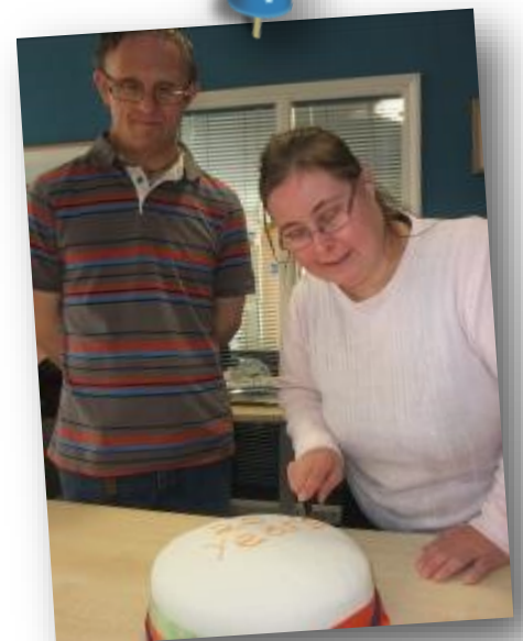
The Cromer Office had a party too!