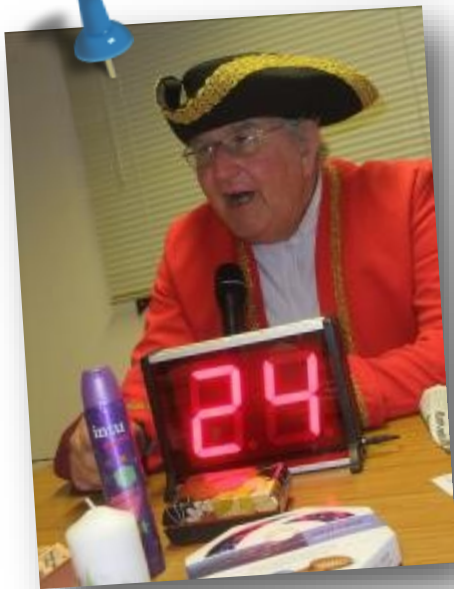
'Two Dozen 24' 'Bingo'!