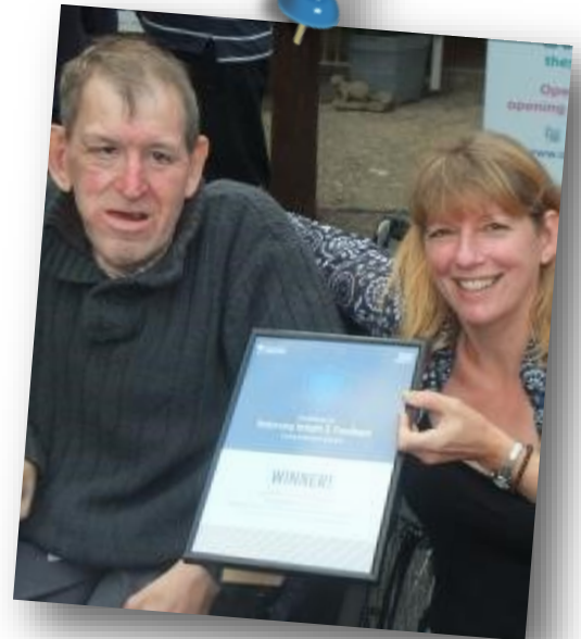
We won first prize for our work with Inclusion East for checking supported living places